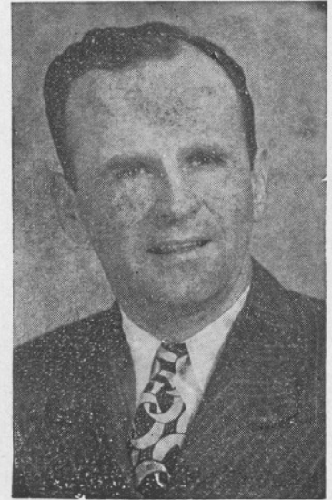
Rev. William Branham

Last summer the people of Canada were disappointed in that the Branham campaigns which had been scheduled for their cities had to be cancelled, due to the physical inadequacy of our Brother William Branham. However, conditions turned in their favor; during these summer months many thousands have been privileged to witness and receive the gifted ministry of Brother Branham.