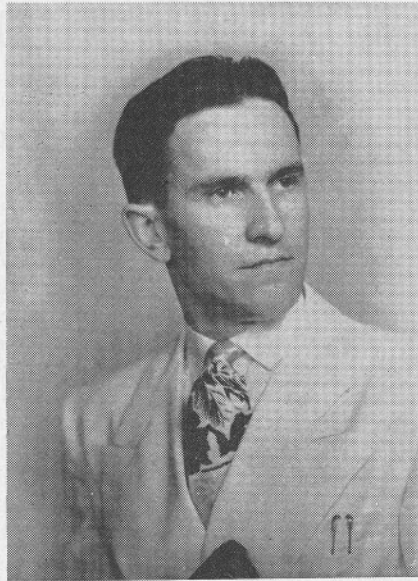
EVANGELIST T. L. OSBORN Tulsa, Oklahoma